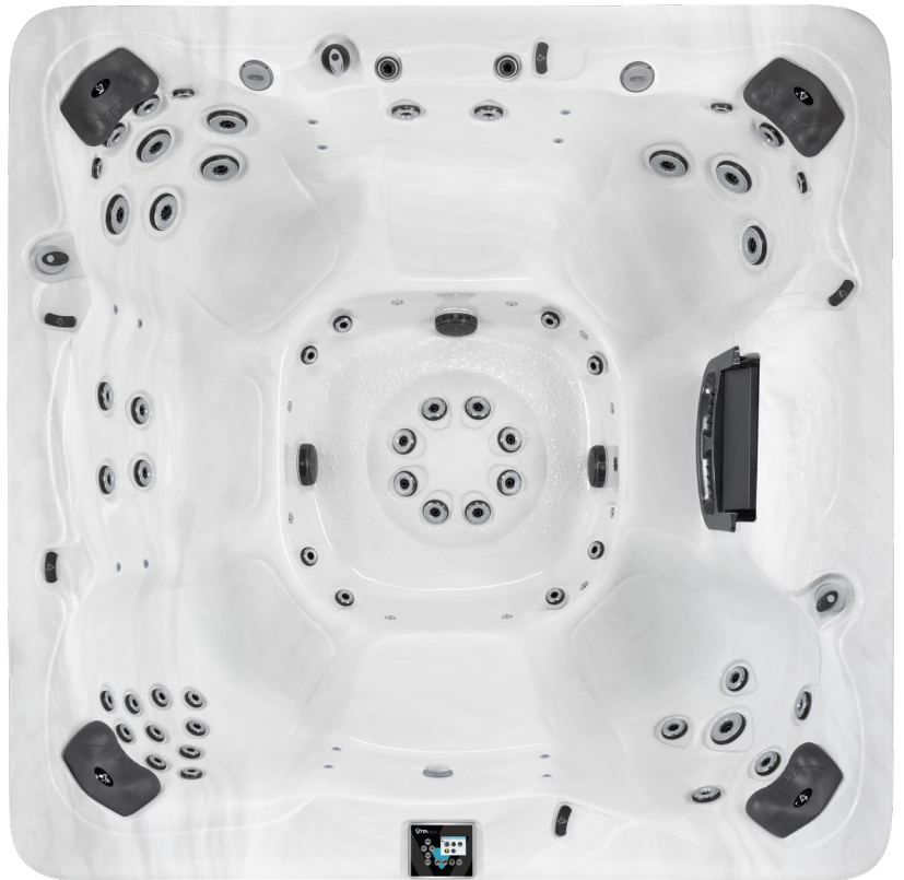
Specifications and styling subject to change. Shown with simulated AquaGlo accents and optional stereo.