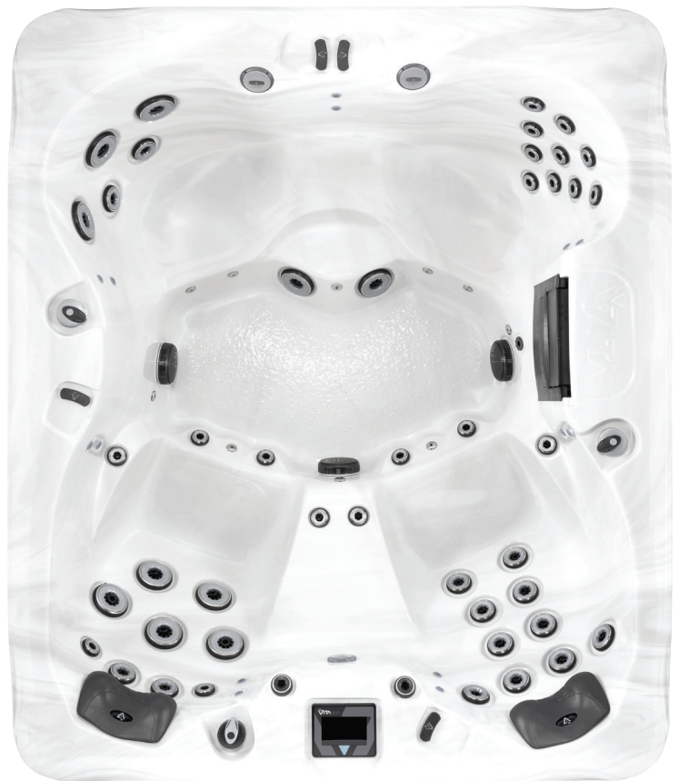
Specifications and styling subject to change. Shown with simulated AquaGlo accents and optional stereo.